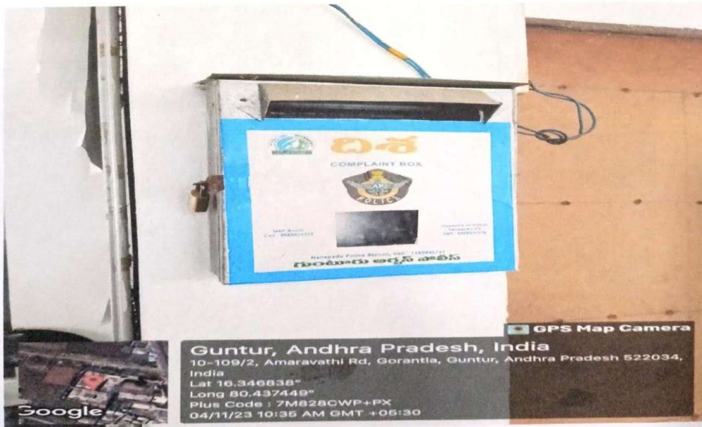
DISHA APP COMPLAINT BOX