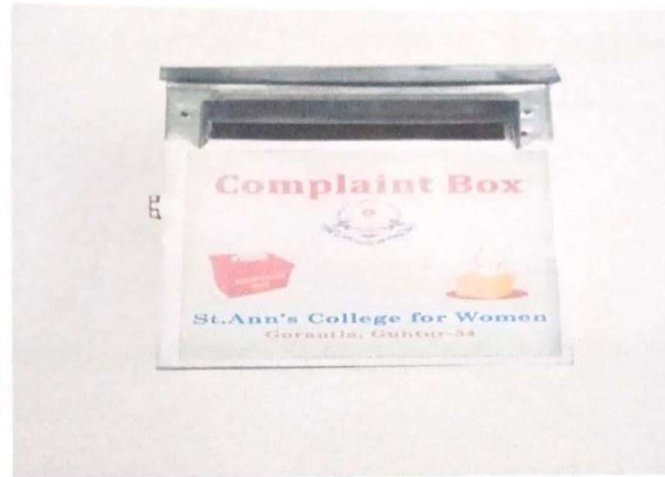
COMPLAINT & SUGGESTION BOX

Email: st_anns_coll@yahoo.co.in Website: www.stannscollegeforwomen.org